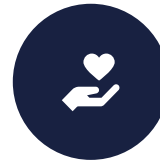
Web and Application Development